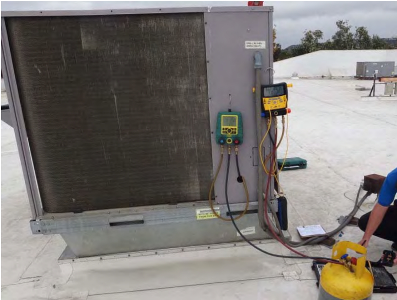
*Charge added from recovery tank during CQM services